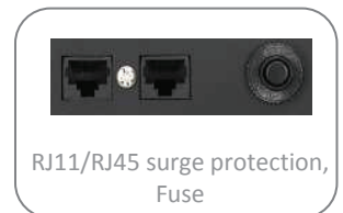
RJ11/RJ45 surge protection, Fuse