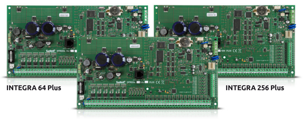
INTEGRA 128 Plus

In addition to detecting and signaling an attempted intrusion or hold-up, these devices also offer simplified access control functions and the ability to implement building automation.